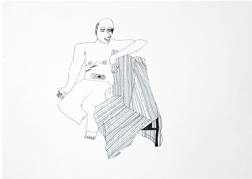
Image left: Lisa Reid, Life Drawing-seated , 2002, ink on paper, 50 x 60 cm.