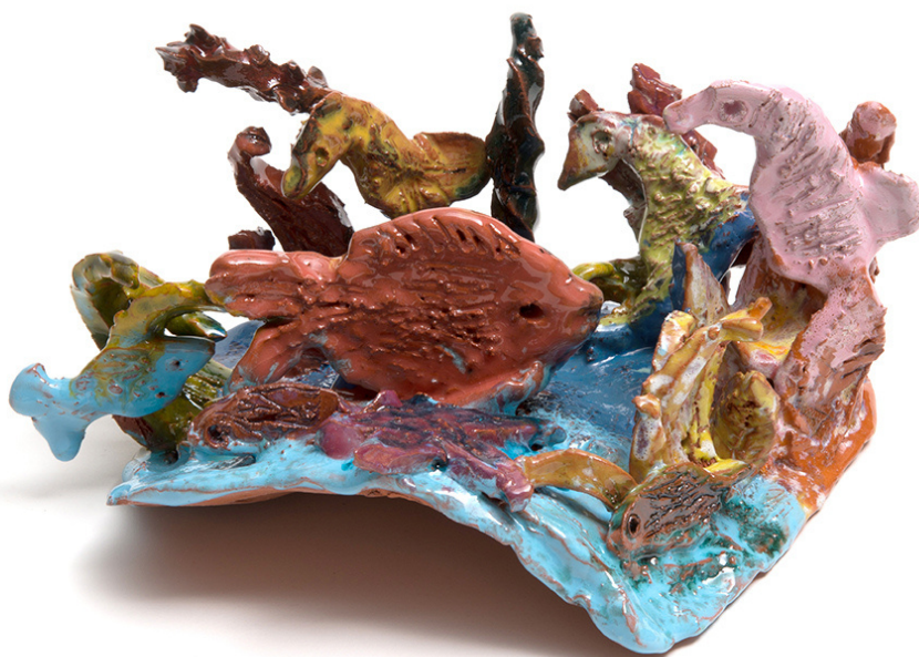
Not titled 2018 glazed earthenware 11.5 x 17 x 20.5 cm GSC18-0005 $140 > purchase online