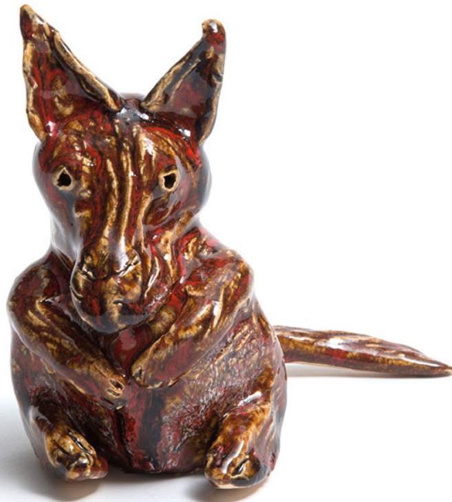
Not titled 2019 glazed earthenware 13 x 12 x 14 cm GSC19-0003 $100 > purchase online