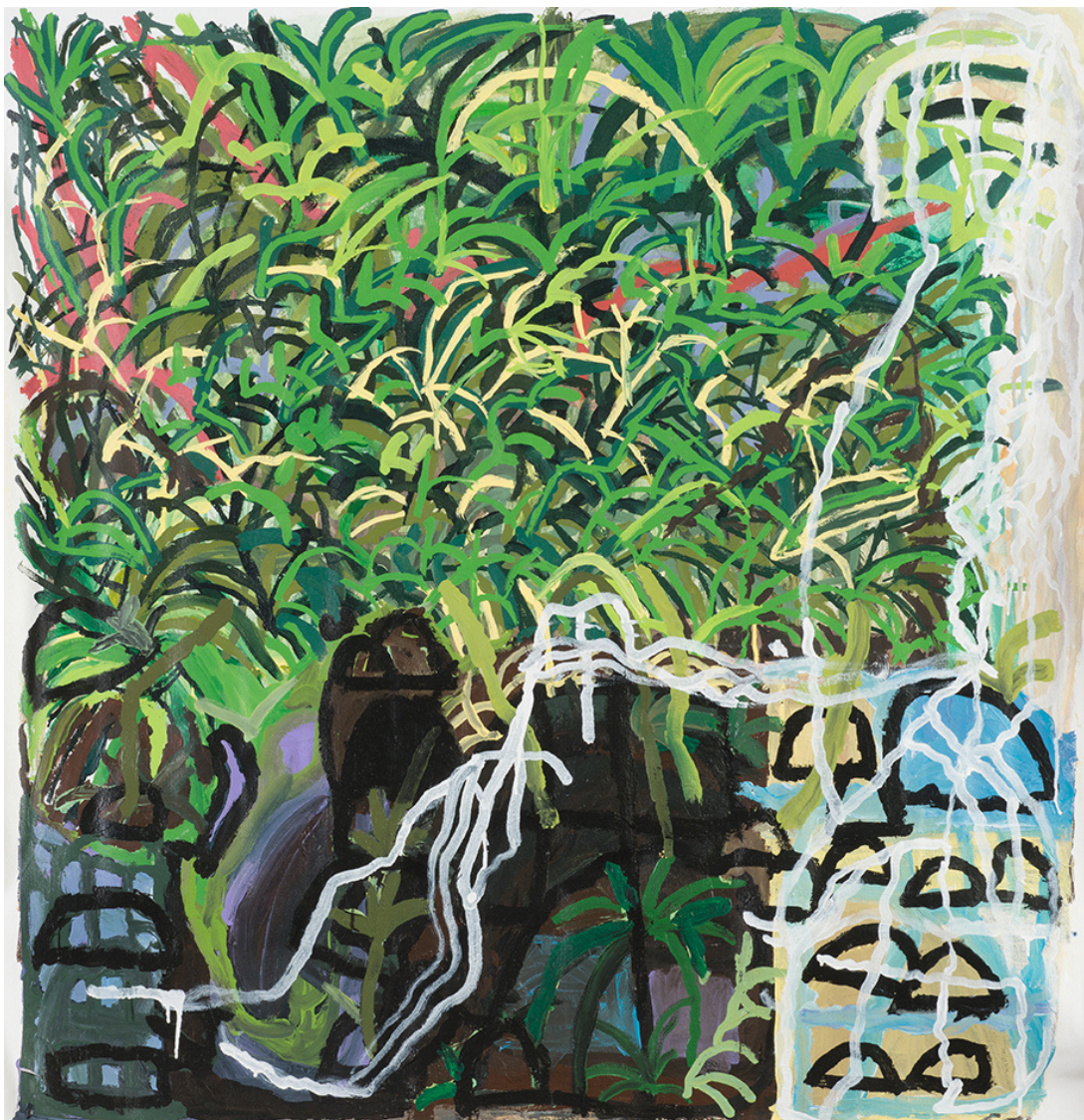
Not titled 2017 acrylic on canvas 116 x 112 cm GSCV17-0001 $1500 > purchase online