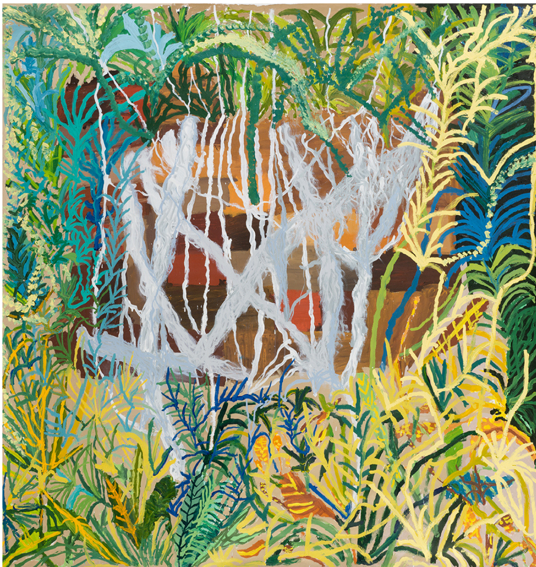
Not titled 2017 acrylic on canvas 166 x 160 cm GSCV17-0002 $1500 > purchase online