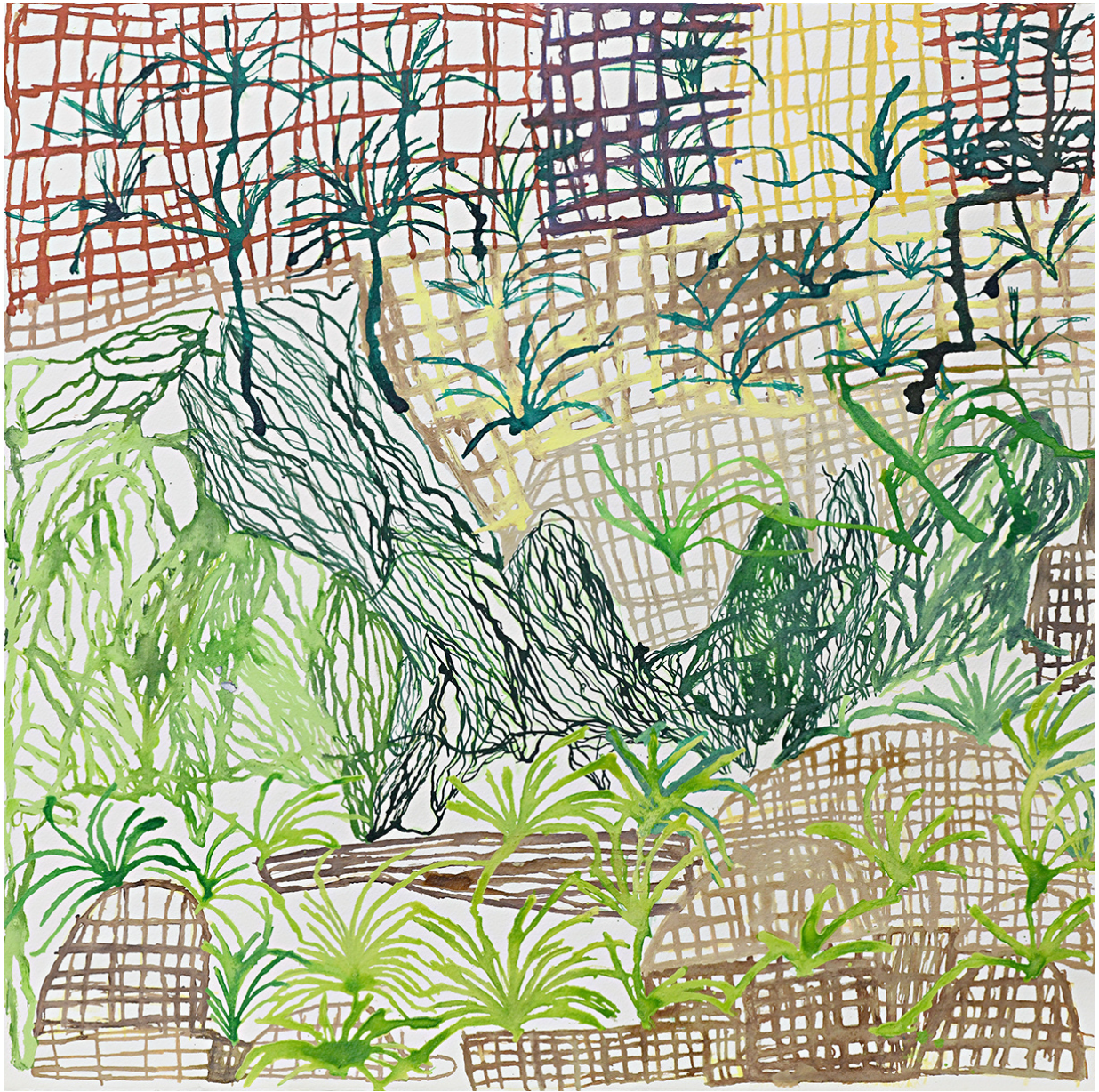
Not titled 2019 ink and pencil on paper 56 x 56.5 cm GS19-0006 $280