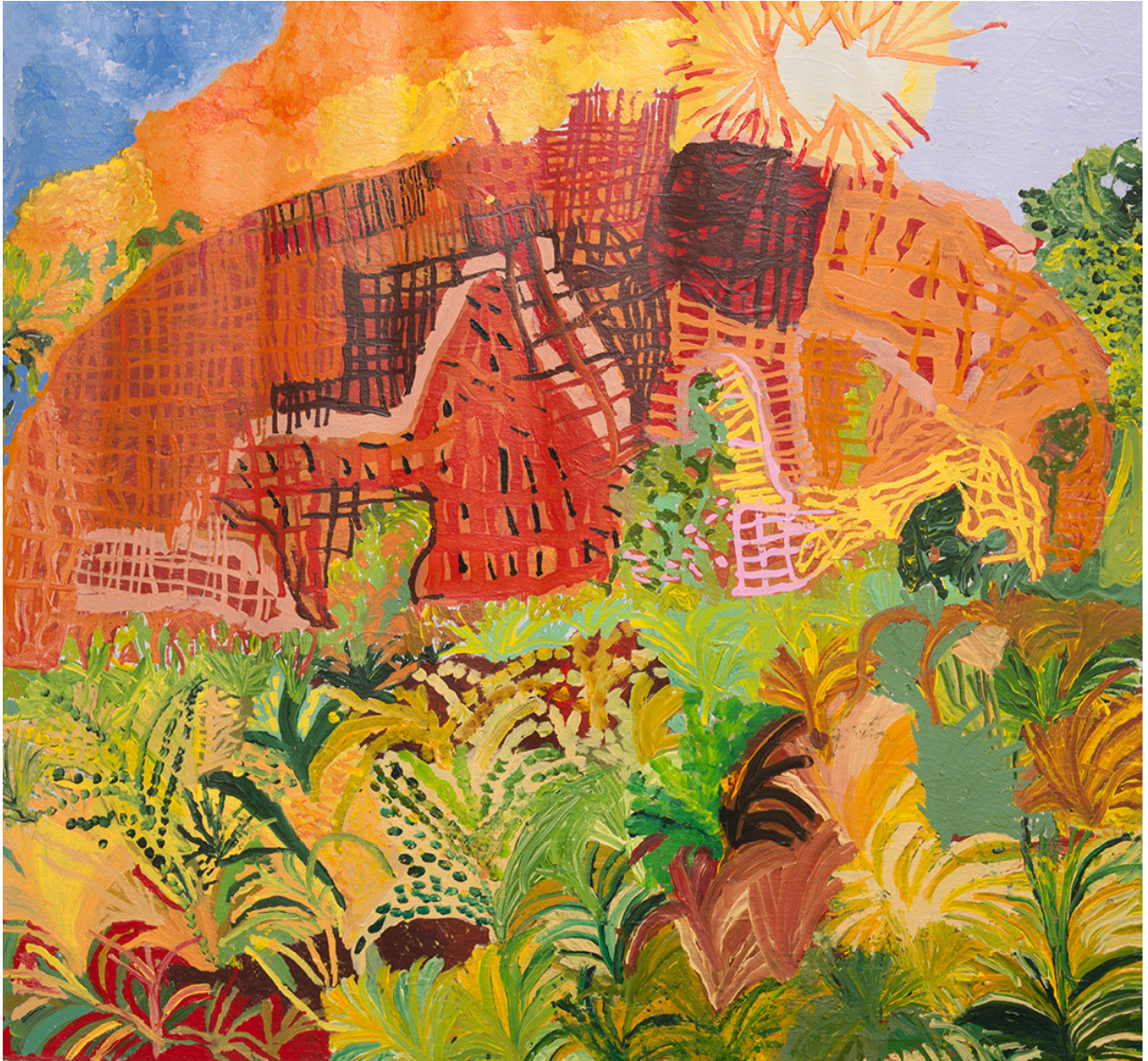
Not titled 2019 acrylic on canvas 88 x 78 cm GSCV19-0002 $500 > purchase online