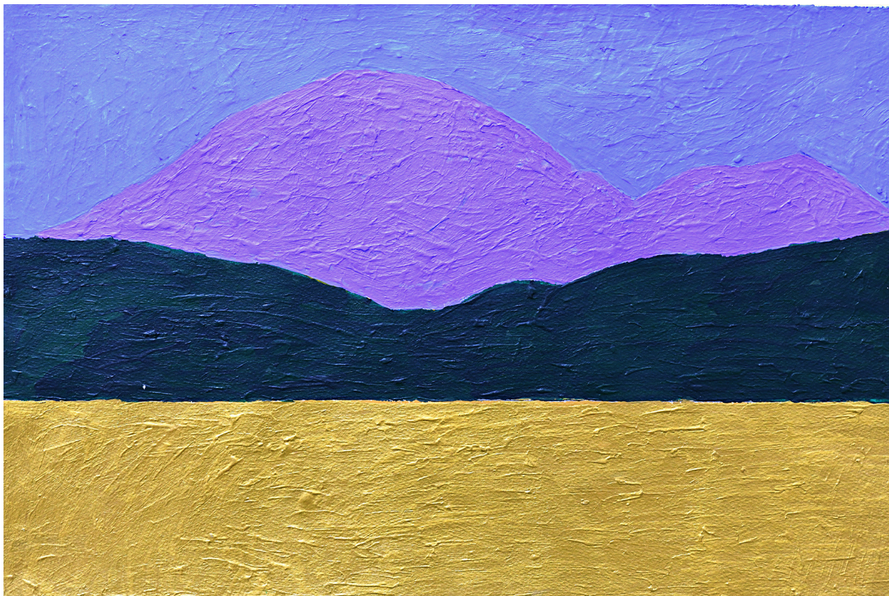
Not titled 2018 acrylic and greylead pencil on paper 37.5 x 57 cm JB18-0008 $380 > purchase online