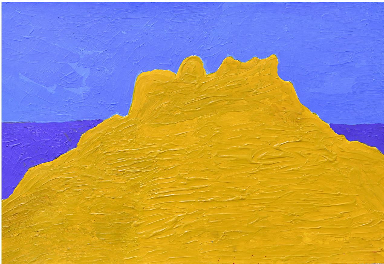
Not titled 2018 acrylic and greylead pencil on paper 38 x 56 cm JB18-0007 $380 > purchase online