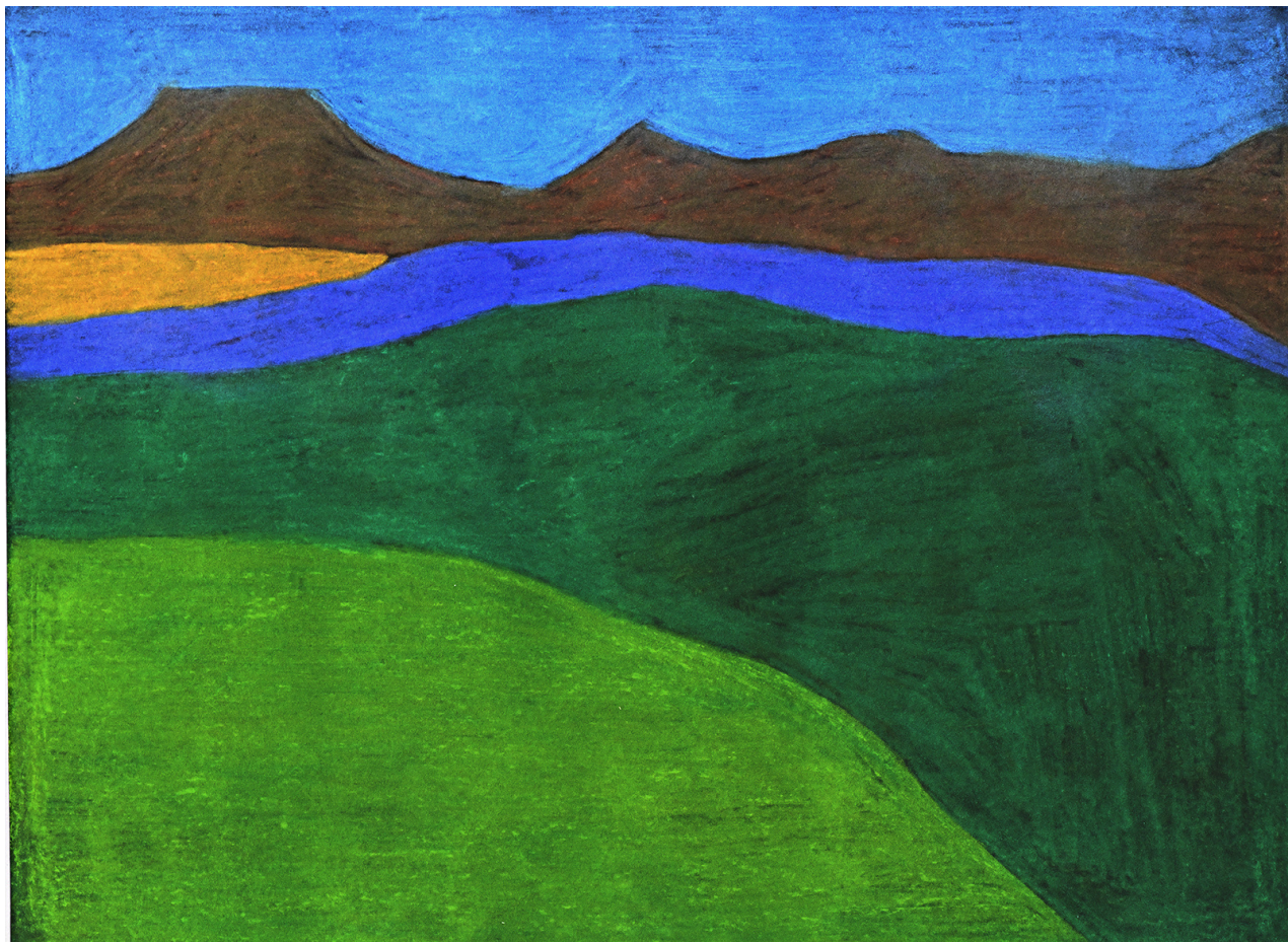
Not titled 2018 pastel on paper 48 x 65 cm JB18-0011 $480 > purchase online