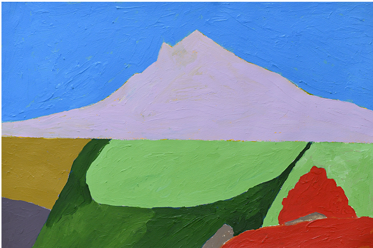
Not titled 2018 acrylic and greylead pencil on paper 37.5 x 57 cm JB18-0006 $380 > purchase online