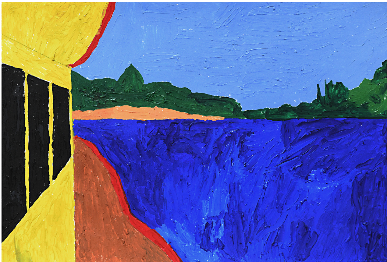
Not titled 2018 acrylic and greylead pencil on paper 38 x 55.5 cm JB18-0010 $380 > purchase online