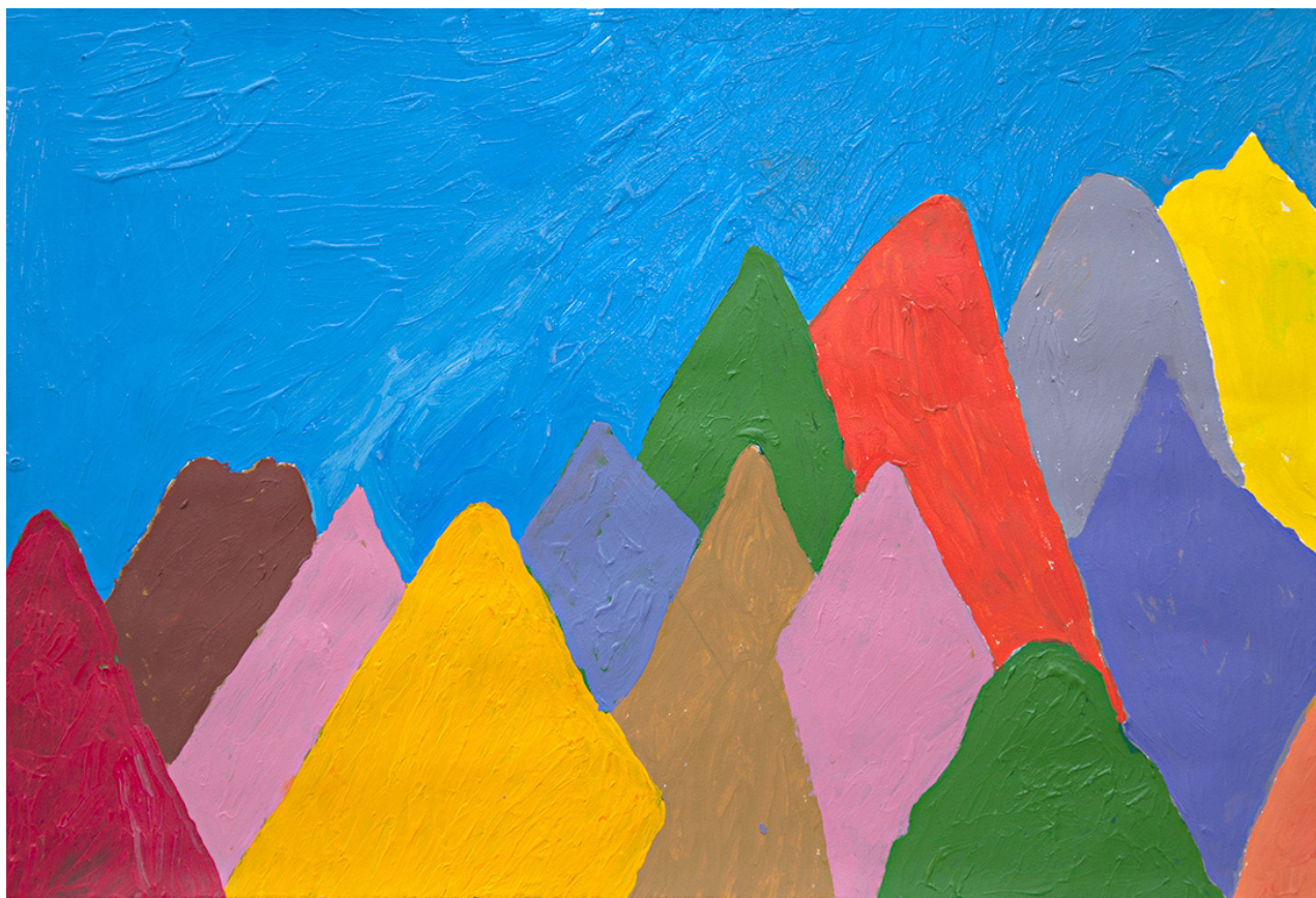
Not titled 2018 acrylic on paper 38 x 56 cm JB18-0003 $380 > purchase online