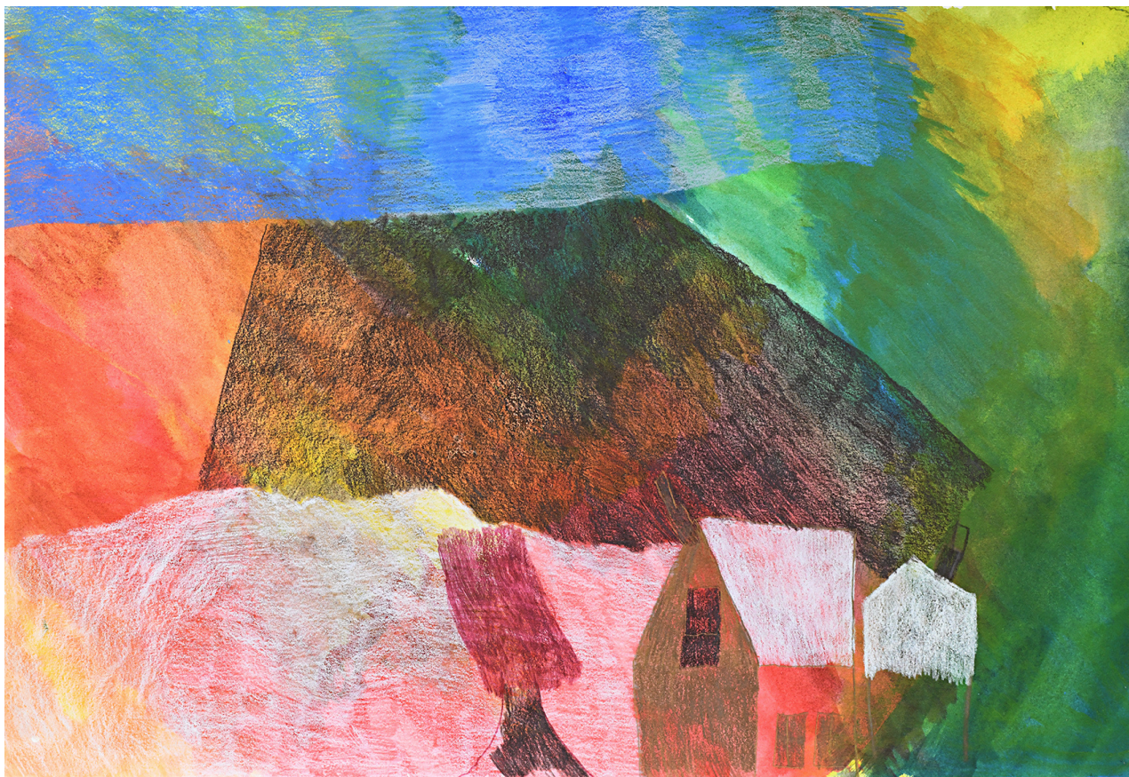
Not titled 2017 ink and pencil on paper 38 x 56 cm MICO17-0004 $150 > purchase online